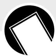
Recommended For Pad Attached Flooring