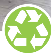
Made From Recycled Materials