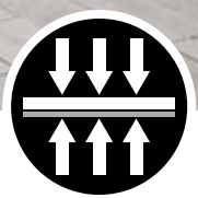
Resists Compression From Daily Traffic