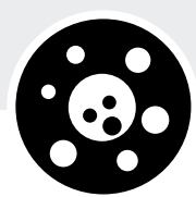
Antimicrobial Treated Fibers