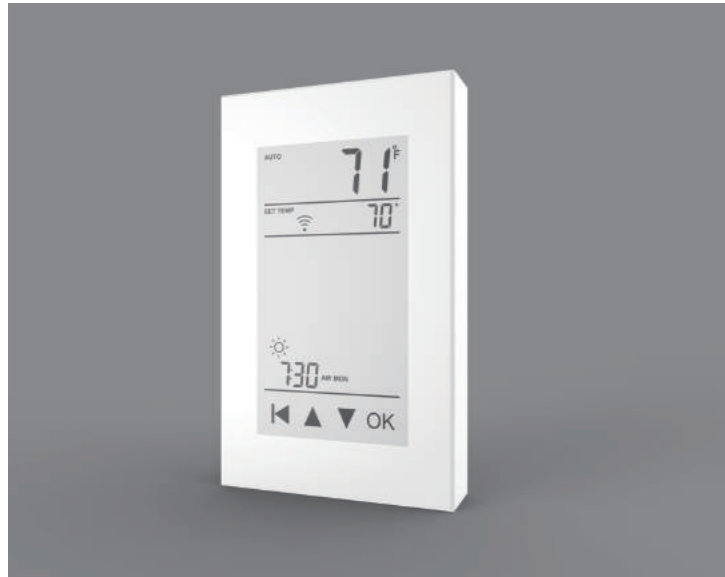
THERMAEGH English V1.2